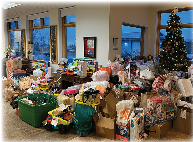
2023 CLP Toy Drive Donations