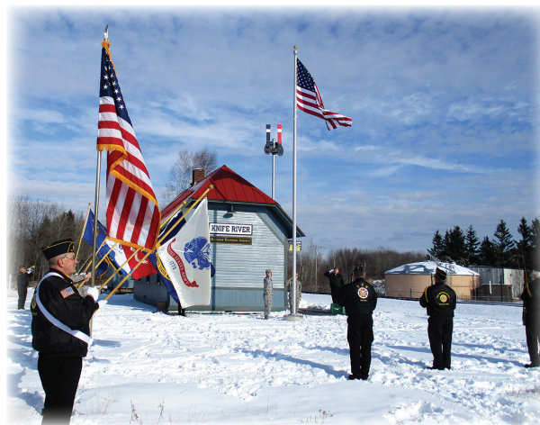
Flag Raising conducted by the Two Harbors American Legion Post 109 supported by UMD Air Force ROTC cadets.