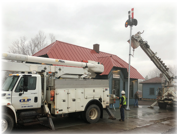
The CLP crew raising the 29' order board railroad signal pole at the Knife River Depot.

"Both the flagpole and the order board pole have added considerable personality to the depot and will add even more so when the flag is illuminated at night. The order board adds too, as it projects a welcoming green light to all passing trains," said von Goertz. He also added, "CLP's assistance was all done without cost to the KRHCC, the savings of which we can now apply to restore our depot back to a functioning 1900s station."