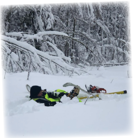
CLP lineman navigating the deep snow.

ber 19th, just as the clean-up from the previous storm was being completed. With trees and power lines already