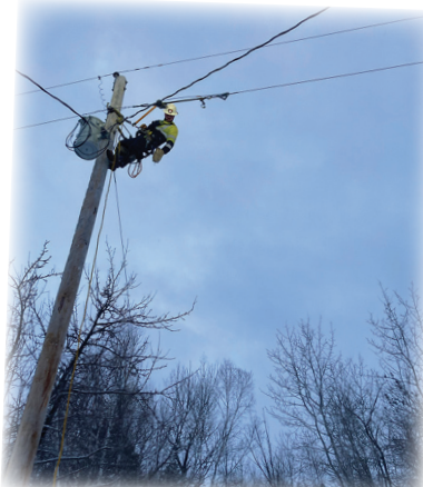
CLP lineman repairing damaged wire.

ber 19th, just as the clean-up from the previous storm was being completed. With trees and power lines already